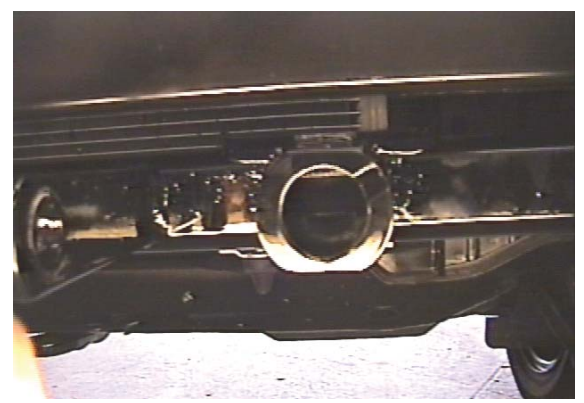
Hold baseplate in place. Temporarily clamp baseplate to the bottom side of metal bumper, while holding a 3/4" space between the bottom of metal bumper and cross tube.

9. Using the baseplate as a template, drill four holes with the 13/32" drill bit, both sides. Insert item 2 into 1 1/4" hole, to align with drilled holes on the inside of frame. Tighten items 3 and 4 into item 2 on the four 13/32" drilled holes, both sides. Be sure and use loctite on all bolts before tightening.